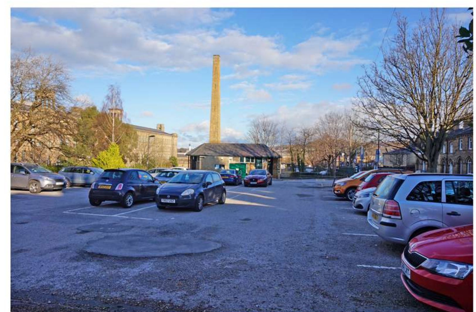
The existing car park is a poor quality space