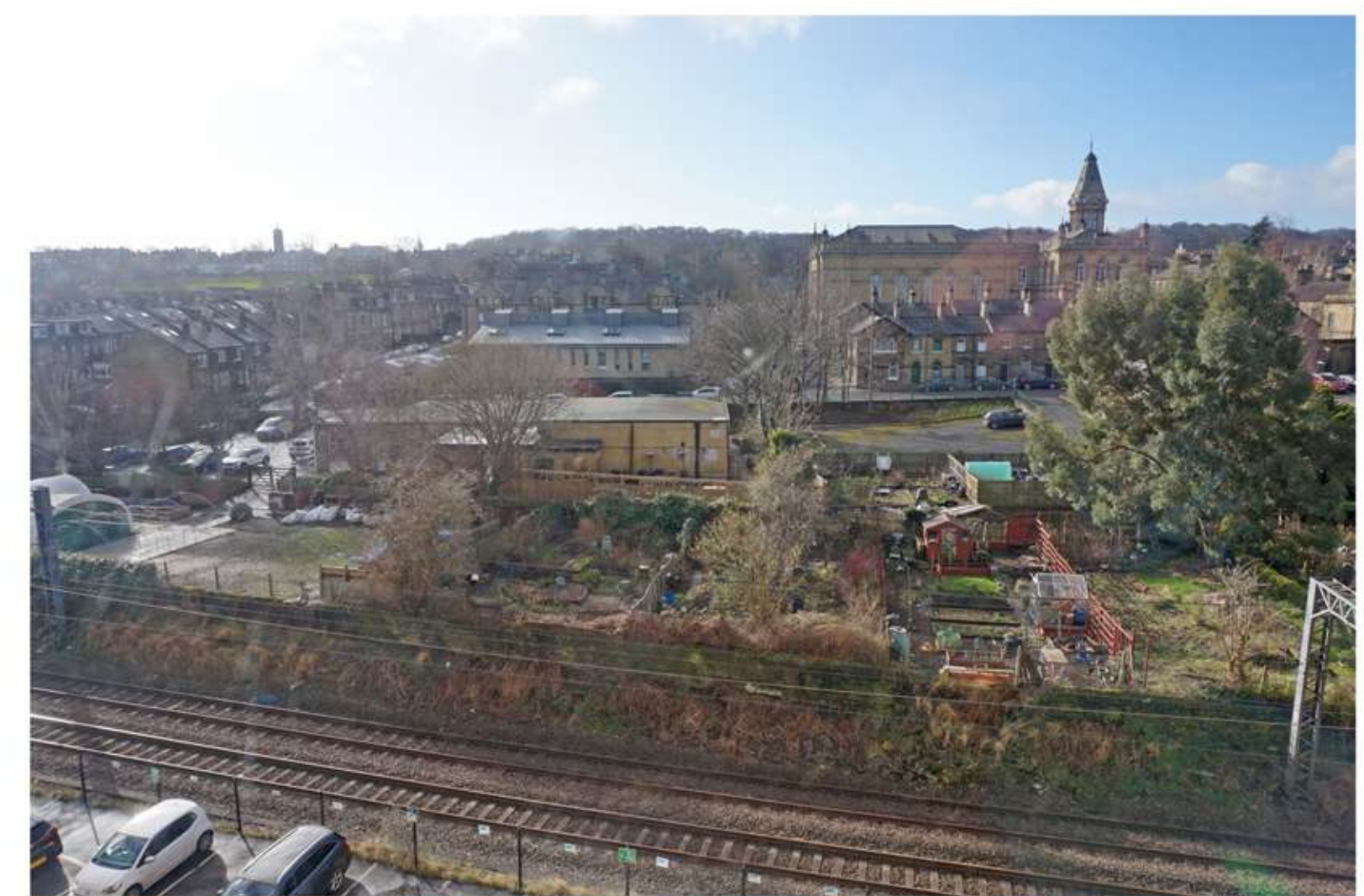
The site is prominent in views from Salts Mill