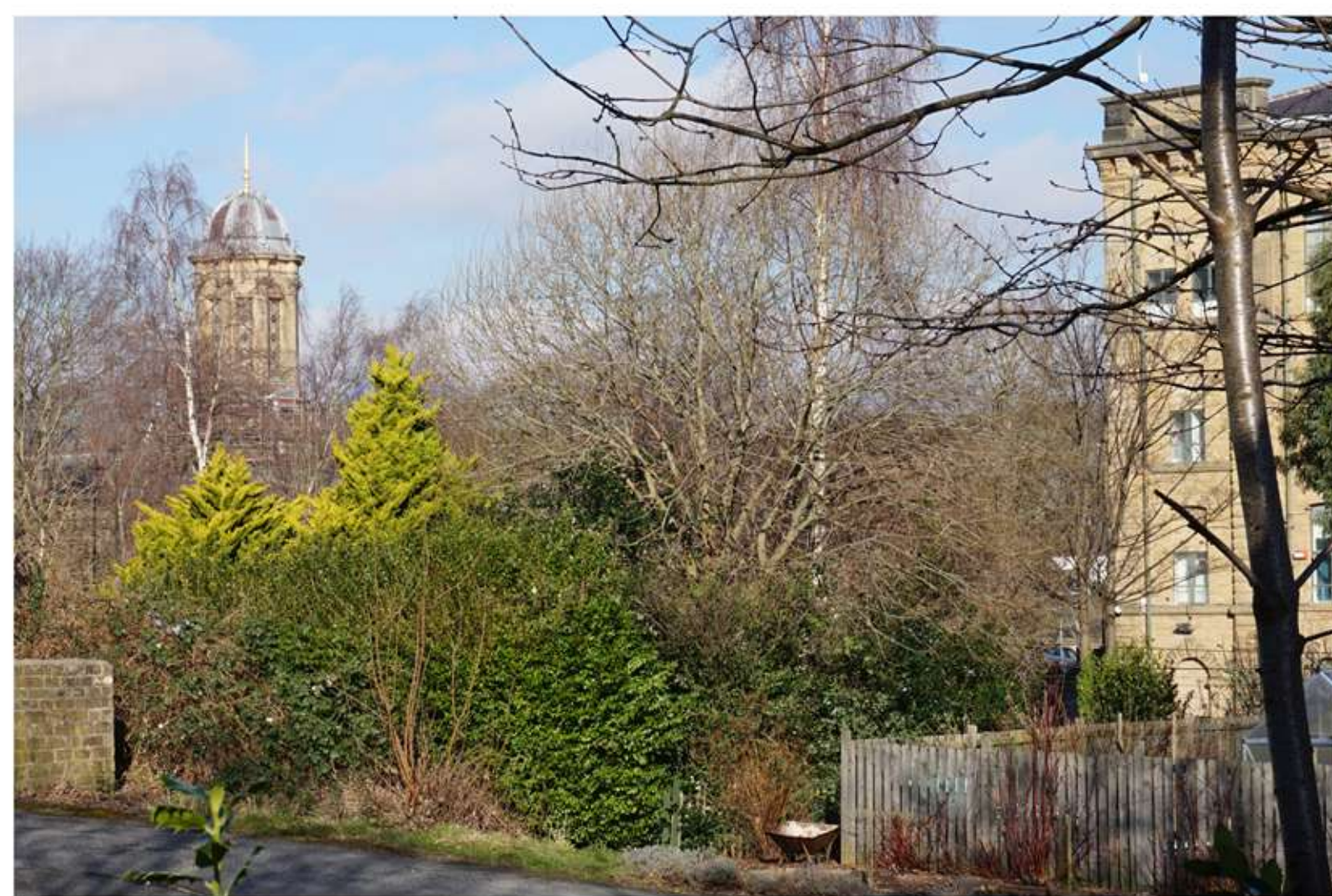
Views to the north-west from the site