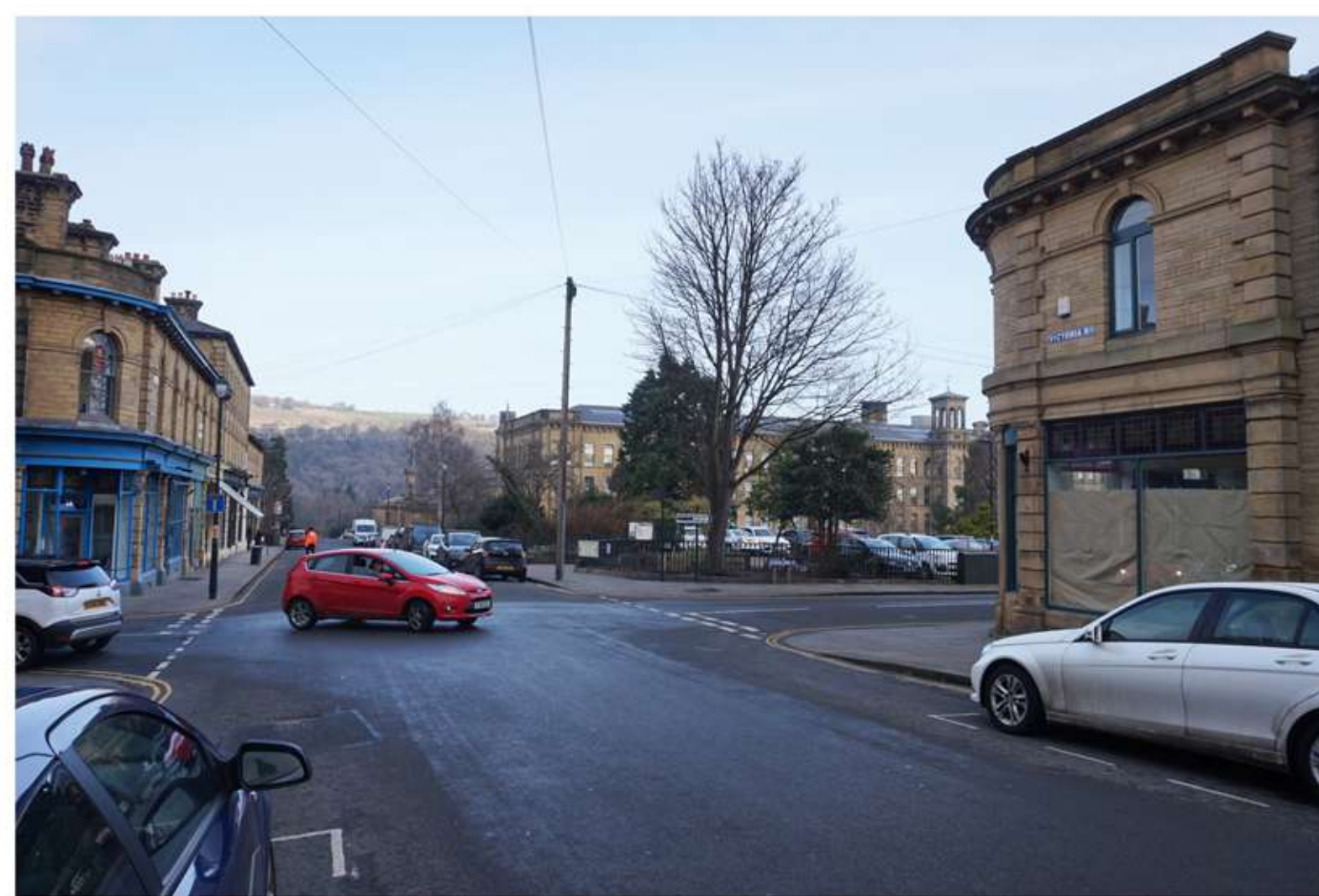
Prominent corner of the site