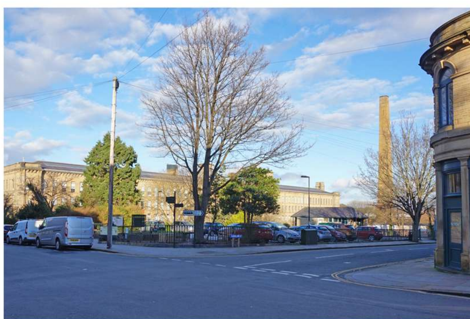
A significant existing tree on the corner of the site