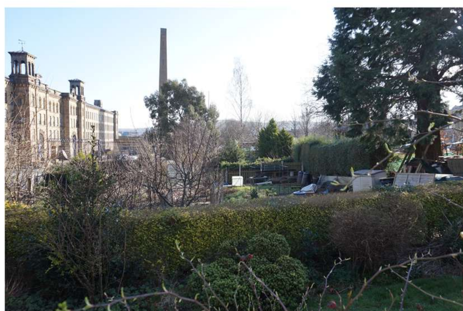
Allotment gardens on the boundary of the site