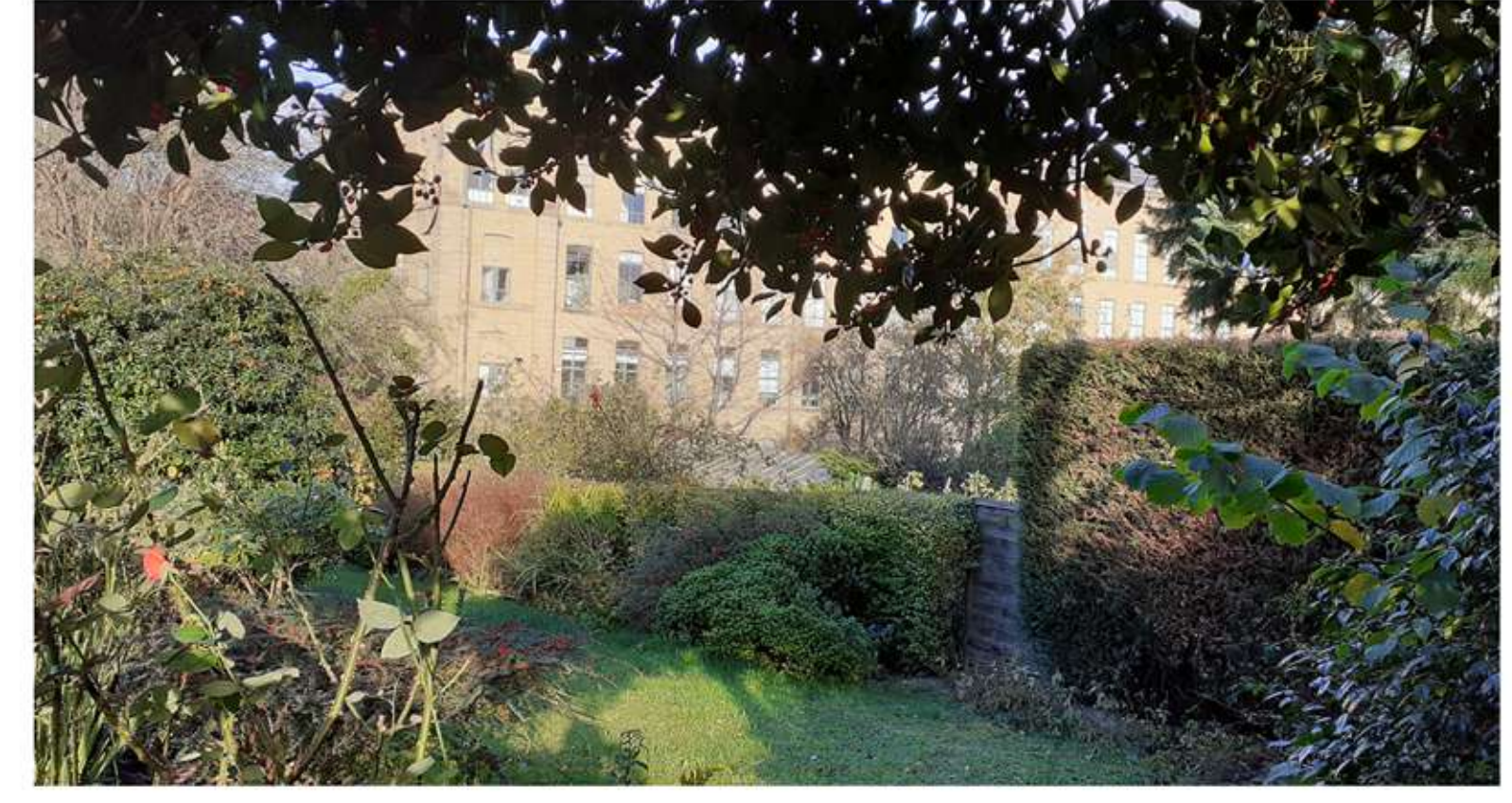
Allotment gardens were part of the original vision for Saltaire The green spaces provide an attractive foreground to Salts Mill