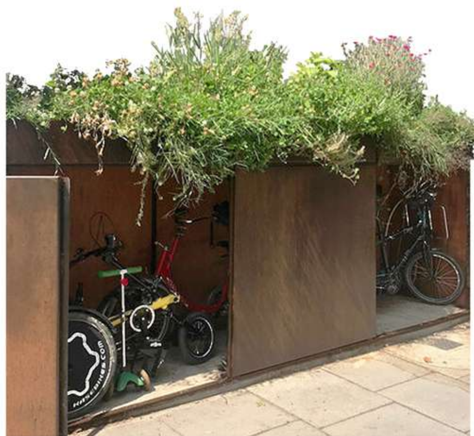
Secure cycle storage lockers