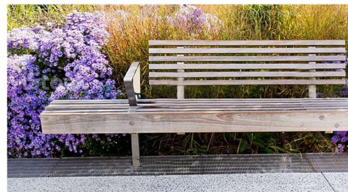
Seating within the new public garden