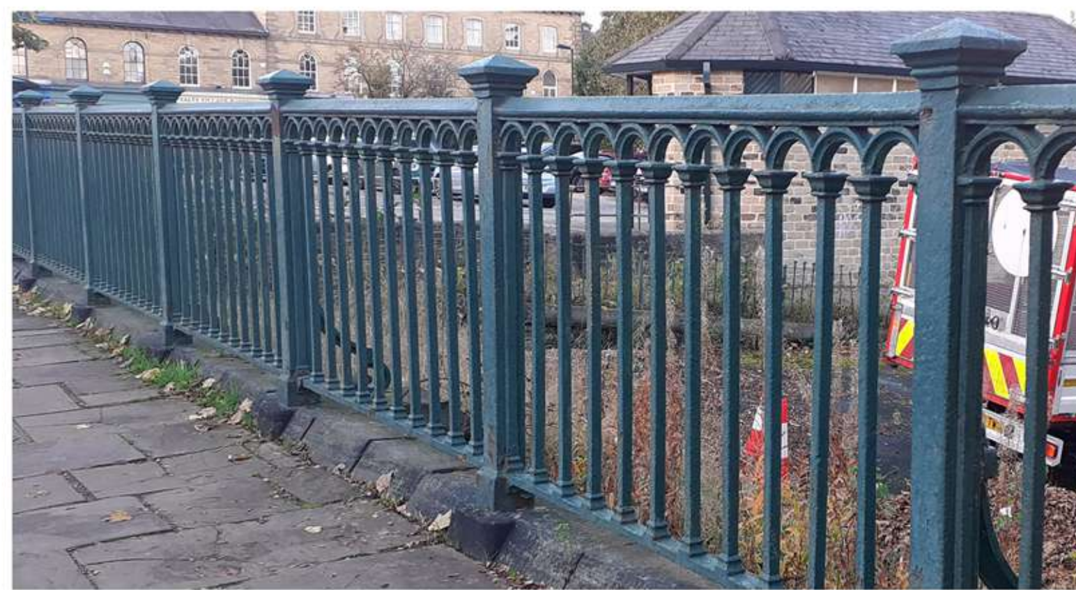
Some elements of original fabric remain intact Original stonework and railings to Caroline Street