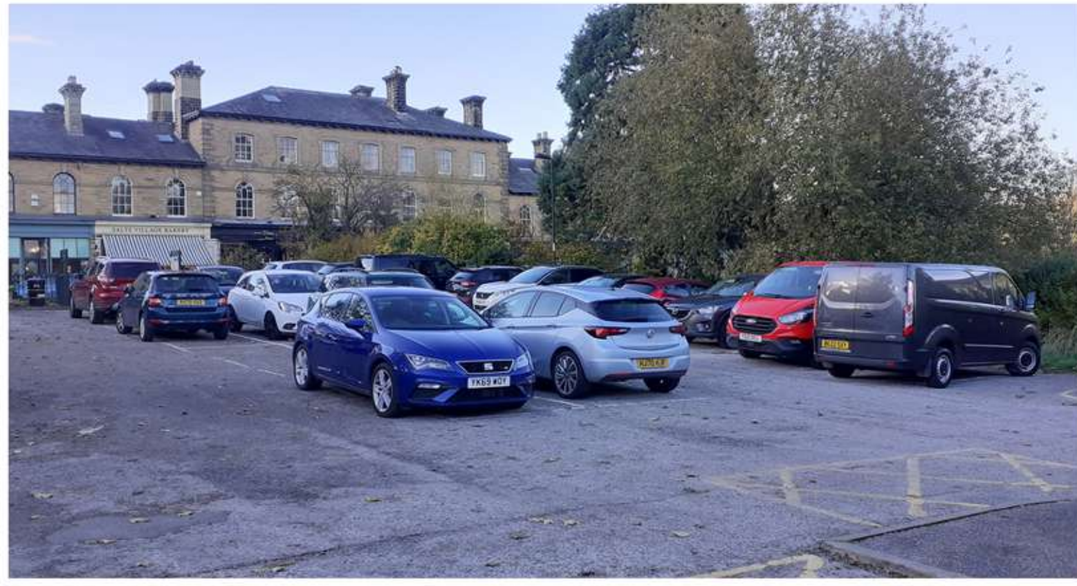
The Caroline Street car park Parked cars occupy an area originally intended to be a green space