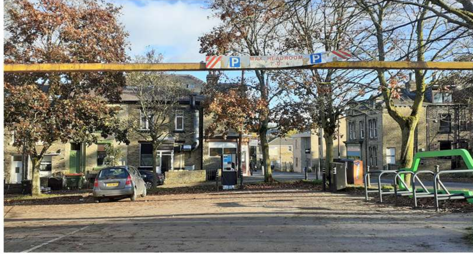
The under-used car park on Exhibition Road Electric vehicle charging points are available in this car park

The civic garden is enclosed by railings and can accommodate local active travel facilities including cycle stands and cycle lockers as well as providing outdoor amenity space. It is designed as a key orientation point within the World Heritage Site for visitors containing information boards and providing access to the public toilets and the heritage hub. Disabled drop off and disabled car parking spaces on Victoria Road will form part of an accessibility strategy for visitors to the World Heritage Site. The public roof terrace will be limited to daytime access.