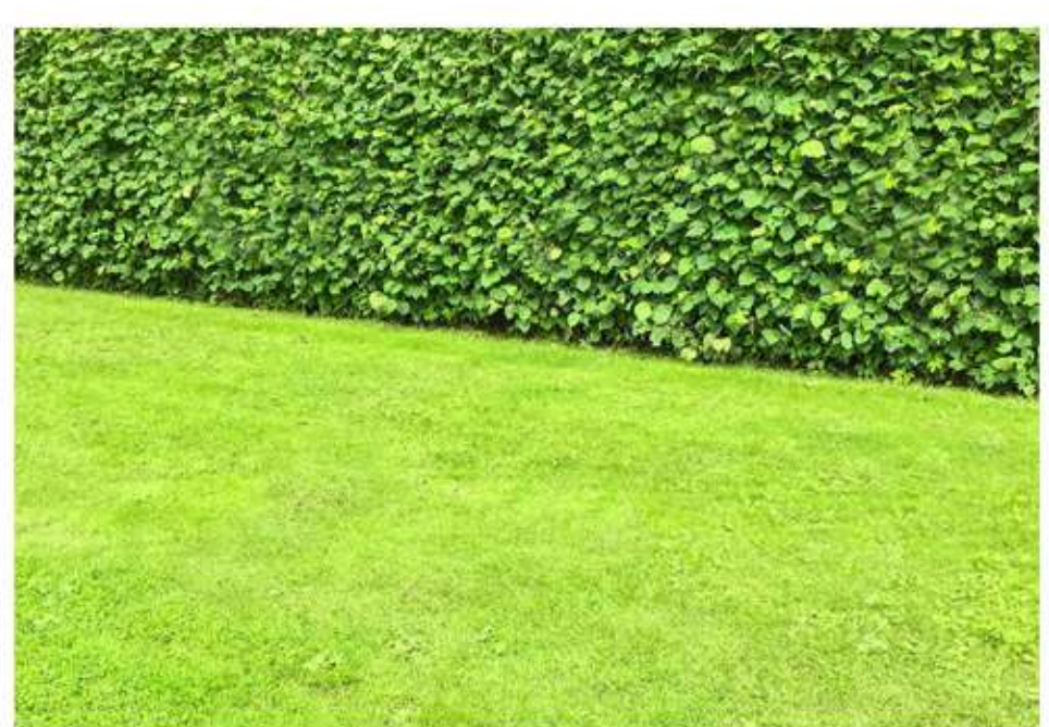
Accessible public green spaces