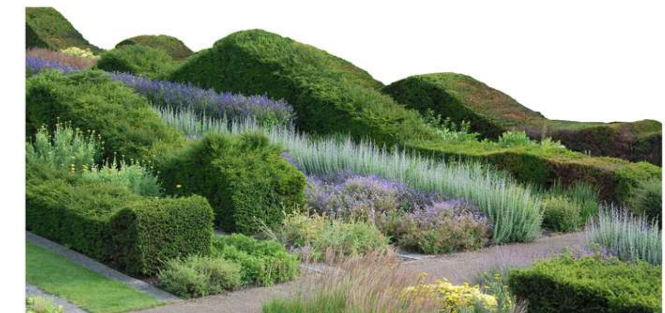
An enhanced landscape setting