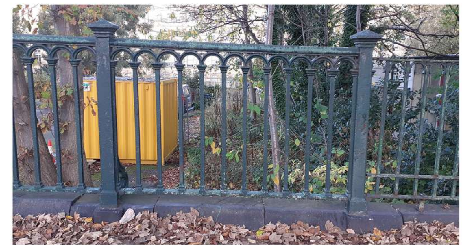
The original railings will be retained and refurbished Poor quality non-original railings will be replaced