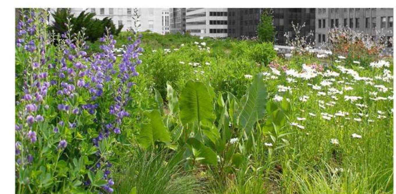
Planting for improved biodiversity