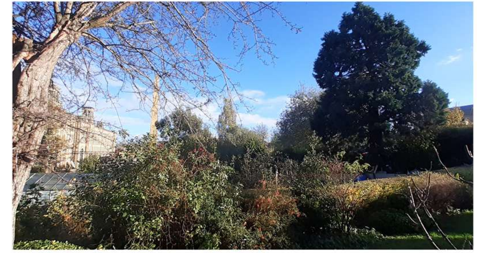
Mature planting defines edges around the well used allotments There are opportunities to increase the amount of green space