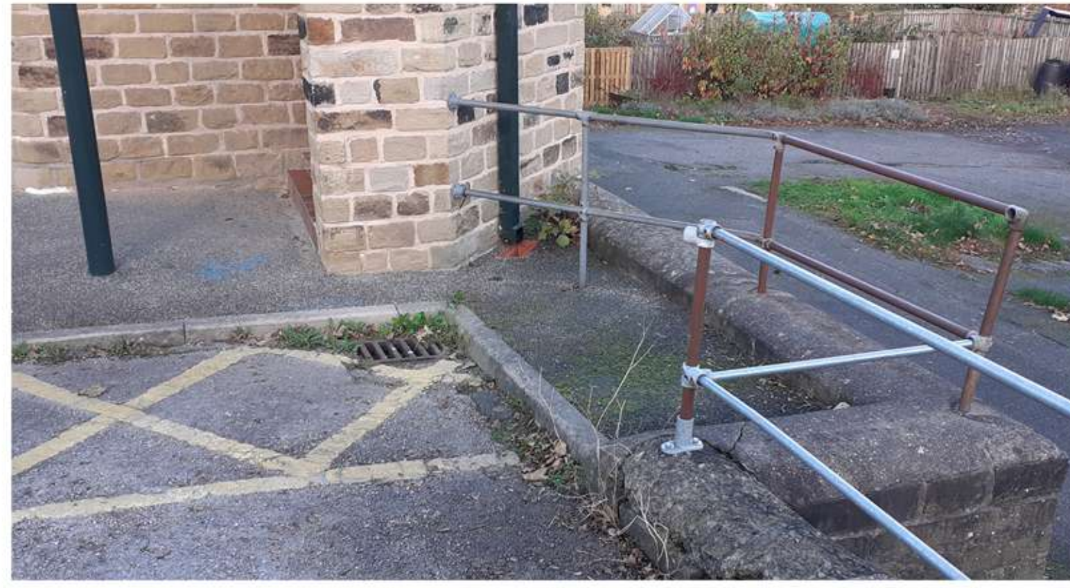
Concrete, tarmac, and rusting steel railings adjacent to the public toilets Poor quality materials in a prominent location