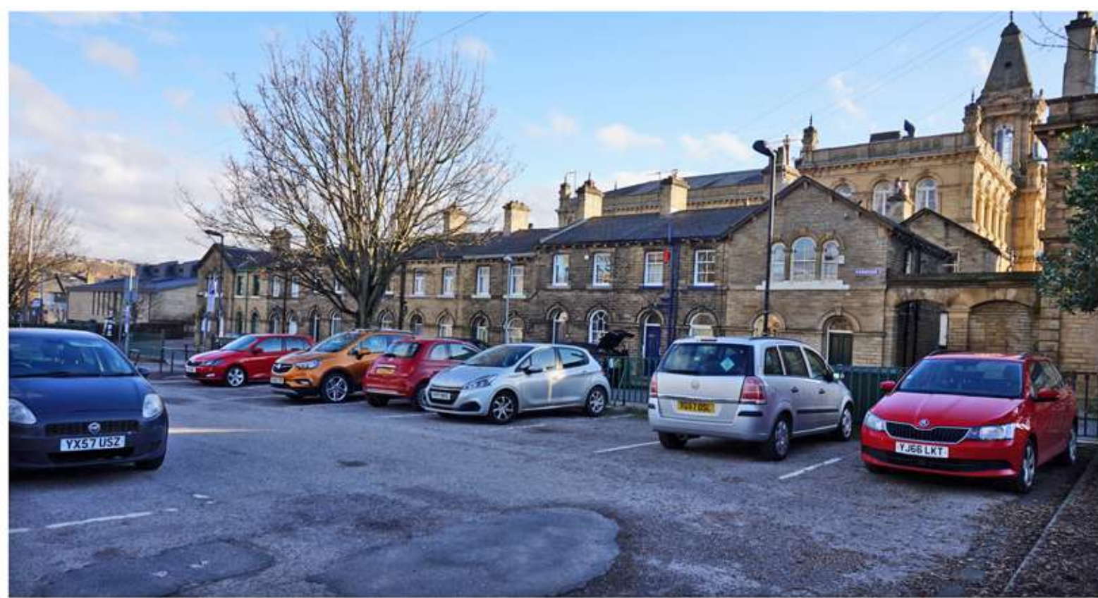
A visually intrusive patchwork of tarmac Cars currently dominate the frontage to Caroline Street