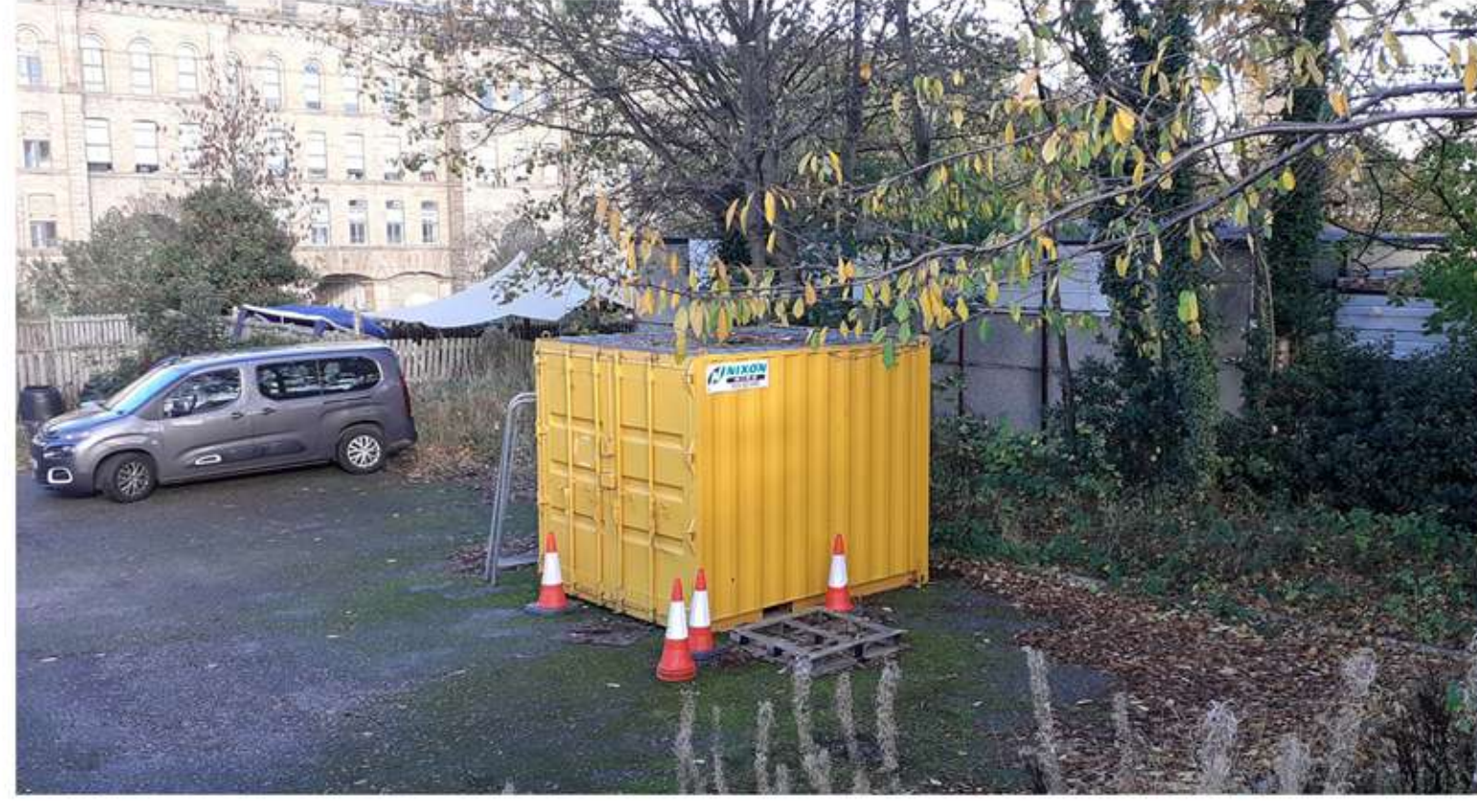
The site of the former St John Ambulance building on Caroline Street A poor quality foreground to the grade II* listed Salts Mill building