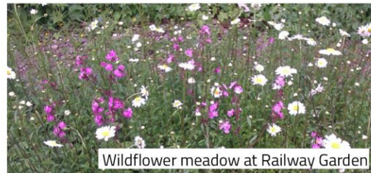
Wildflower meadow at Railway Garden

We began creating a range of wildlife habitats in the Railway Garden in 1996. These included ponds, a dry stone wall, wildflower areas and a mixed hedge. The idea was to link our garden with other green spaces next to the railway line in Saltaire and develop a 'wildlife corridor' that would help many different species of plants and animals to thrive.