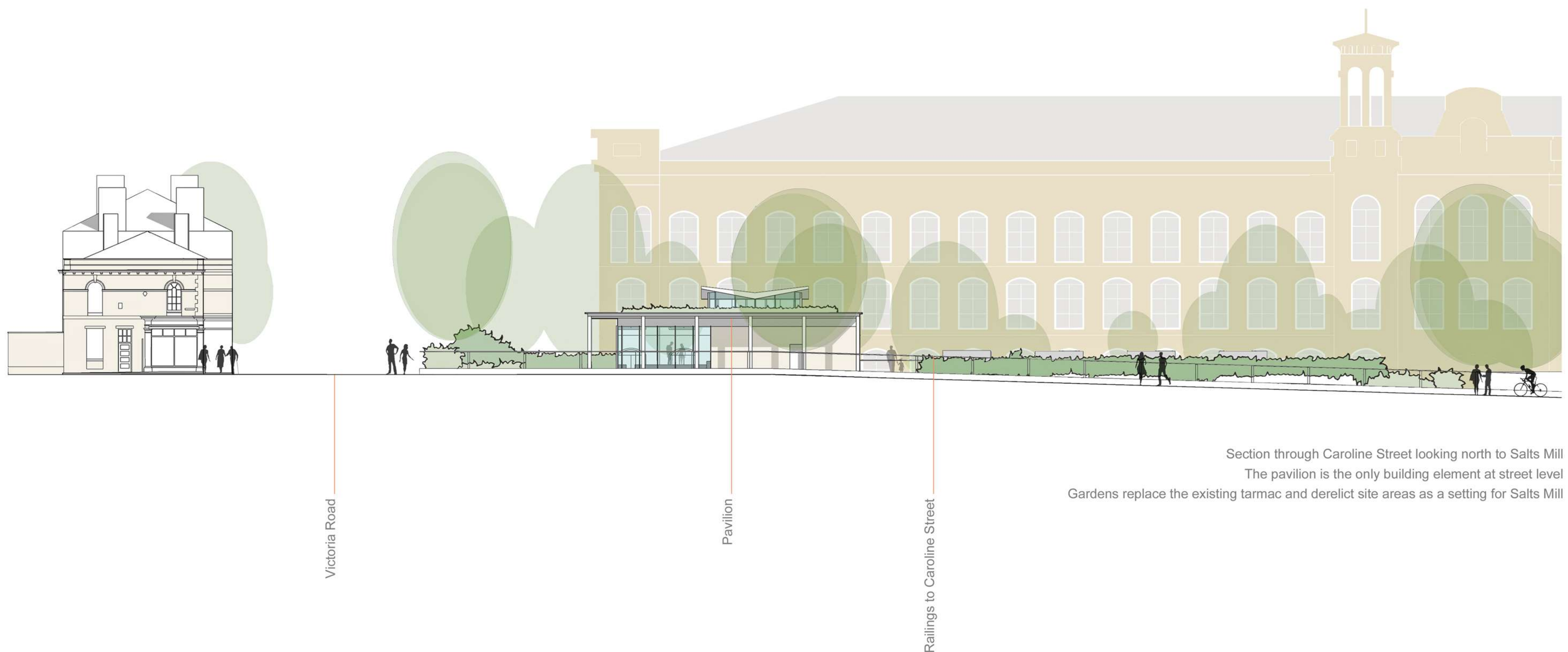
Section through Caroline Street looking north to Salts Mill The pavilion is the only building element at street level Gardens replace the existing tarmac and derelict site areas as a setting for Salts Mill