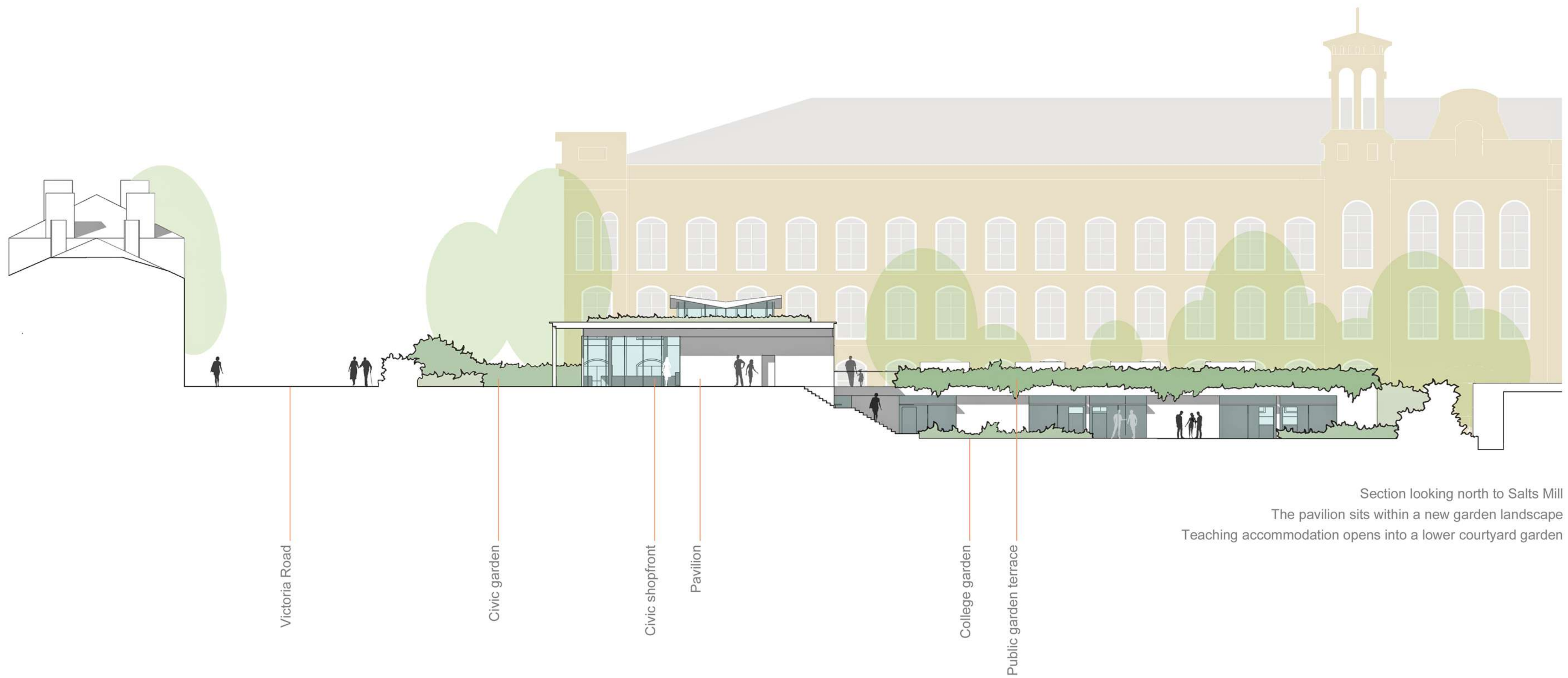
Section looking north to Salts Mill The pavilion sits within a new garden landscape Teaching accommodation opens into a lower courtyard garden